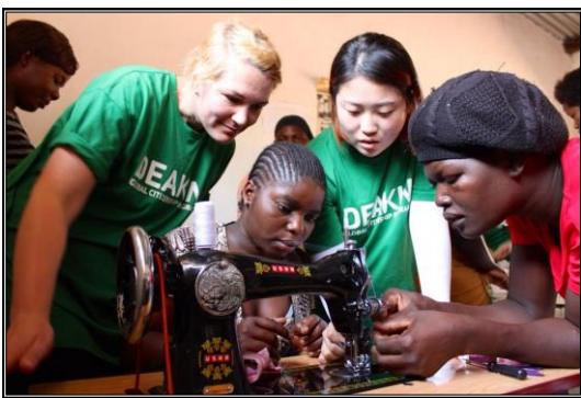
Machine sewing lesson