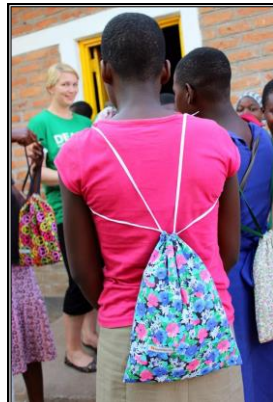
Carrying my D4G Kit