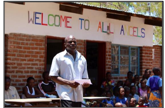
Formal welcome by Community Leader