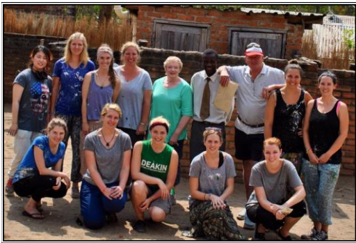
2014 Team Malawi

Some money is needed – amount yet to be specified – for roof repairs and general maintenance at the primary school.