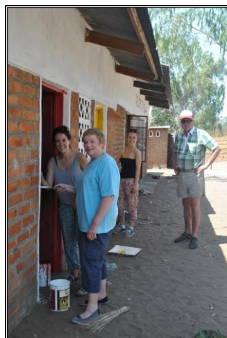
Refurbishing & painting